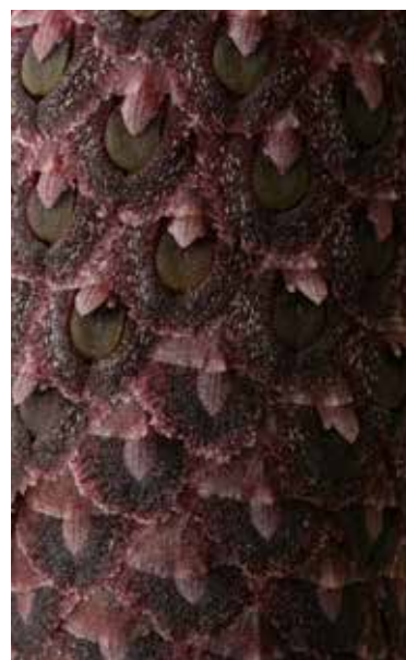
Detail of the strange flowers of the giant Bulbophyllum coriophorum .