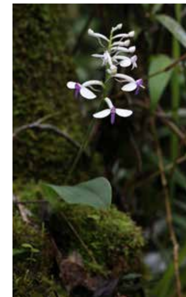
Left Cynorkis lowiana flowers in profusion on wet roadside banks near Ranomafana National Park.