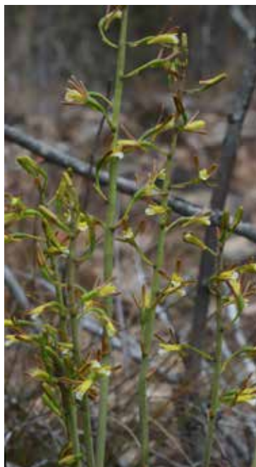
Eulophia ibityensis is locally common in Madagascar in woodland of highland areas.

The next year was spent meticulously planning and costing an itinerary, based on almost 20 previous trips. In partnership with Mary and our friends at Malagasy Tours in Madagascar it was decided to go for the 'comfortable but flexible' option with several small vehicles, taking in a good cross section of this very large and diverse country. Mid-September to early October were fixed as dates, perhaps not the peak orchid flowering season but less likely to be affected by cyclones, leeches and