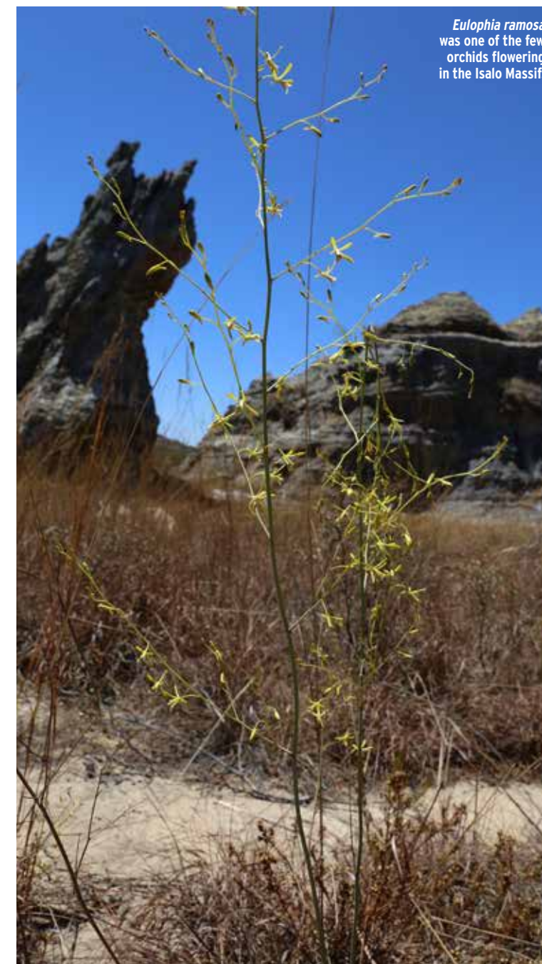
Eulophia ramosa was one of the few orchids flowering in the Isalo Massif.

The next main stop was Isalo, two days' drive further south. It was becoming warmer and drier with