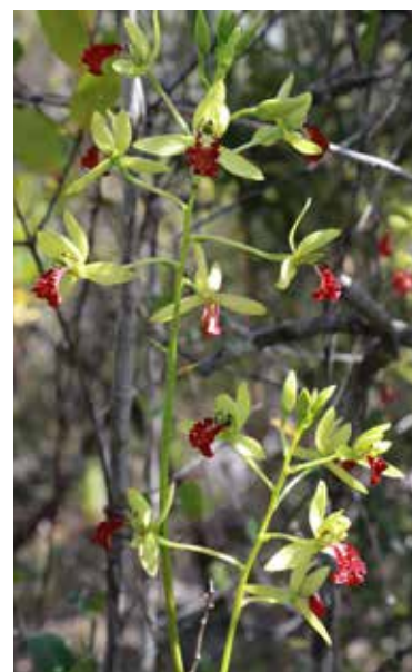
Cymbidiella flabellata was found in coastal scrub near to a football pitch by Lake Ampitabe.

passion for orchids. As always Madagascar did not disappoint and provided a total of 81 different orchid species or almost 10% of the entire