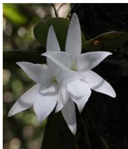
Above The Andringitra Massif (desert of rocks), part of the Andringitra National Park, at sunrise. Right Mass flowering of the tiny Bulbophyllum leptostachyum in Ranomafana National Park. Far left The intrepid Orchid Conservation Alliance group at the entrance of the orchid 'garden' at Andasibe-Mantadia National Park. Left Aerangis fastuosa was encountered in full bloom at Ranomafana National Park.