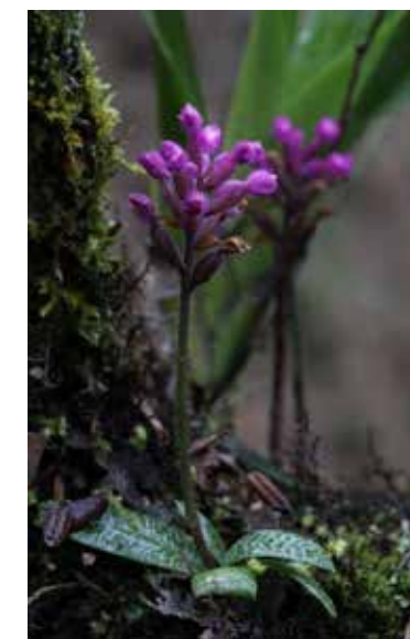
Below Tiny Cynorkis peyrotii is made distinctive by its marked leaves.