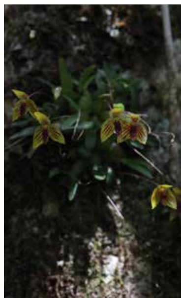
Bulbophyllum pandurella forms small clumps on the main trunk of trees.