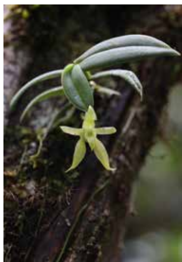
Lemurella pallidiflora is a small twig epiphyte in Mantadia National Park.