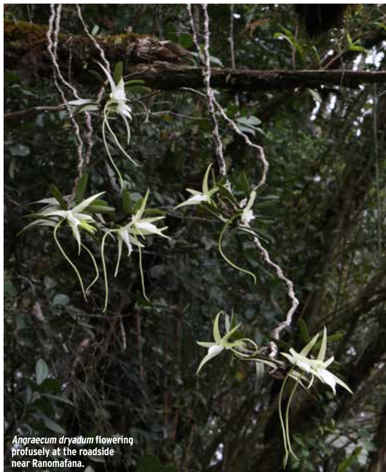
Angraecum dryadum flowering profusely at the roadside near Ranomafana.