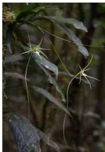
Aeranthes schlechteri flowers suspended from a long inflorescence at Mantadia National Park.

had the same idea of some pre-trip relaxation; not surprising as most were travelling the very long haul from the west coast of America.