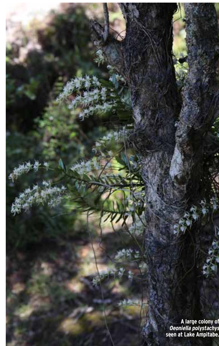
A large colony of Oeoniella polystachys seen at Lake Ampitabe.

After a gruelling nine-hour drive back to the capital for a magnificent farewell dinner it was now time to say goodbye to the group; we had learnt to appreciate all those 'unusual in any environment', and had made some great new friends with a common