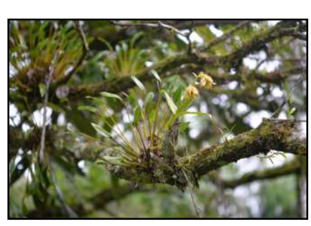
Row 1. Views of the volcano (Turvuvur) climbed by some of the group, locals demonstrating the cooking of Megapode eggs in the boiling water draining from the base of the volcano Row 2. Some photos from the boat trip to the Duke of York archipelago Row 3. The Baima Fire Dancers, New Britain. World War II artifacts. Row 4. A few of the orchids spotted on the tour. Trichotosia sp., Dendrobium cf. silvanium , Dendrobium finisterrae