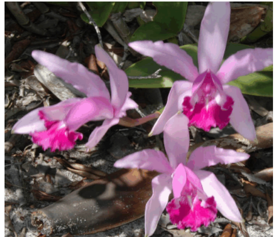
Cattleya intermedia at large in Brazil